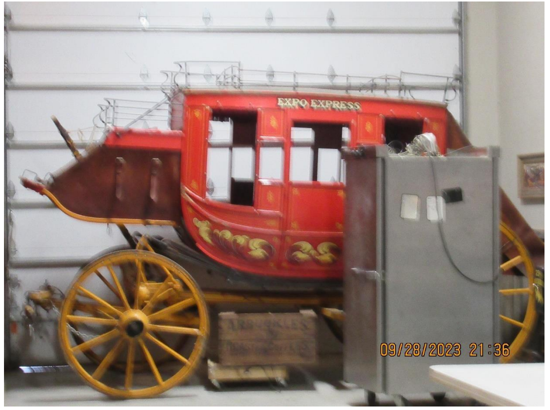
WHAT AN AMAZING PLACE TO HOLD A FAST DRAW CONTEST.