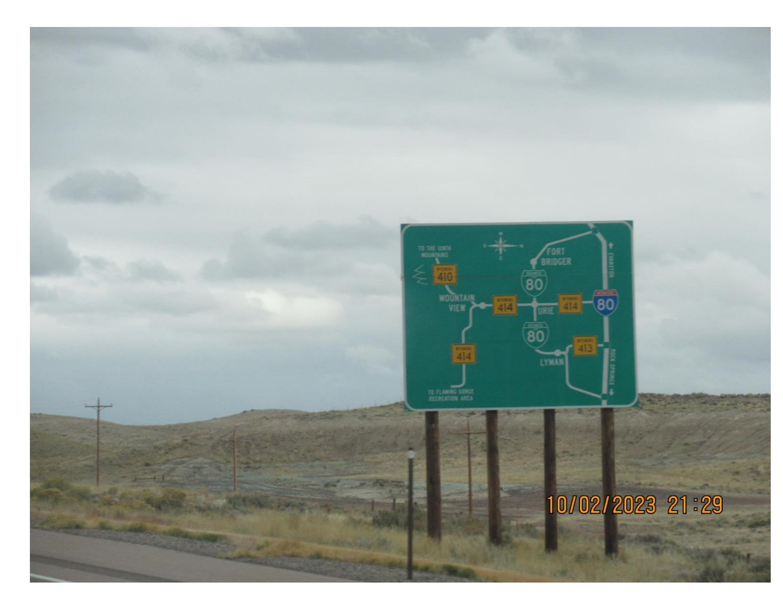
THIS HELPED US FIND OUR WAY BACK TO IDAHO.